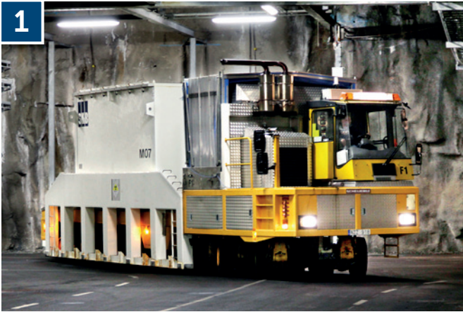
1 The waste arrives at the SFR on board SKB's transport vessel M/S Sigrid to be taken down to the facility in specially designed transport containers.