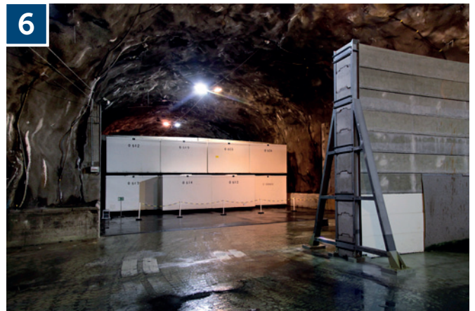
6 Rock vault for low-level waste in concrete tanks. The tanks are moved using a fork-lift truck.