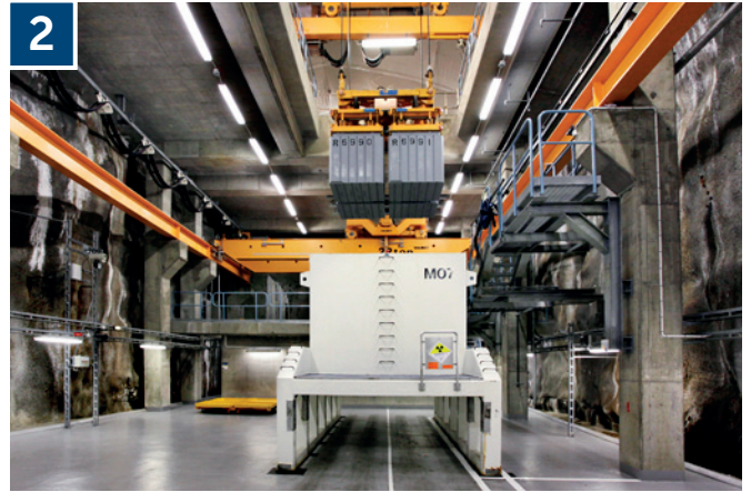
2 Here the transport container is unloaded and scanned on the outside to discover any radioactive substances on its surface.