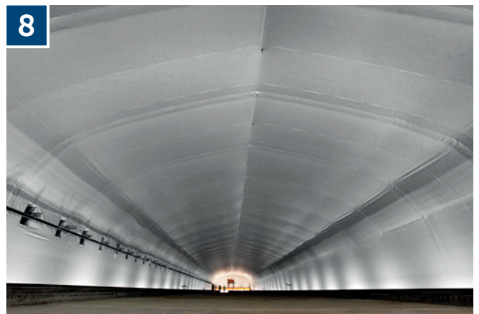
8 Here intermediate level waste is deposited in barrels or moulds. An overhead crane monitored from the control room is used to move them.