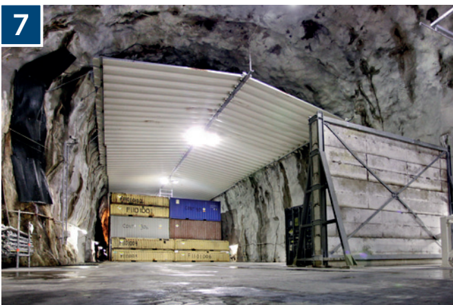
7 In this rock vault low level waste is deposited in regular containers that are moved using a fork-lift truck.