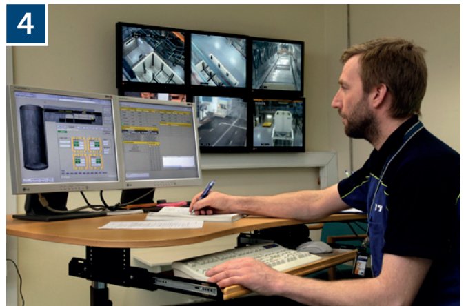
4 The overhead crane and the unloading of the transport containers are monitored and directed from the control room.