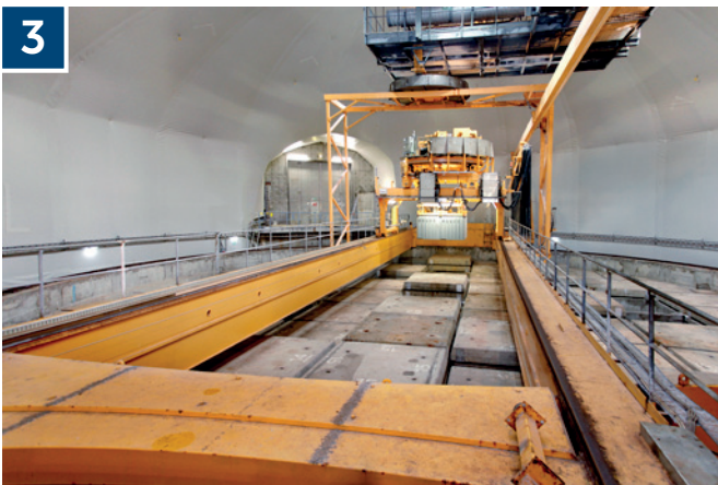
3 An overhead crane is used to move the waste containers to the top of the silo. The silo is divided into shafts into which the waste is lowered.