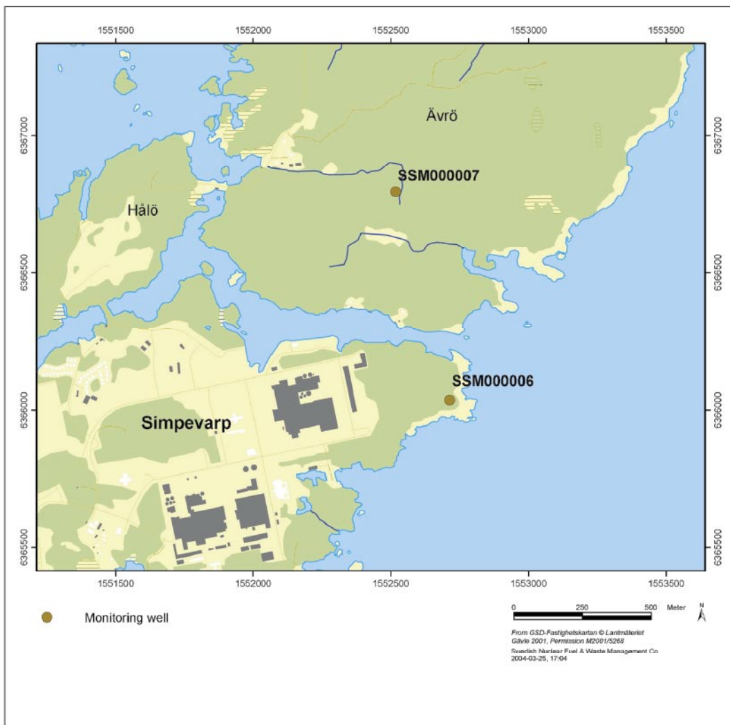
Figure 1-1. Location of ground water monitoring wells SSM000006 and SSM000007.

Before the start of core drilled holes, shallow wells in unconsolidated soil are needed to comply with SKB environmental monitoring procedures (SDP-301 and SKB MD 300.003, internal documents). The environmental control procedure requires that at least one monitoring well is installed and that reference samples for water and soil are collected.