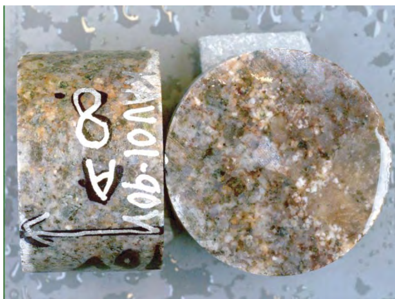
Figure 5-2. Specimens KAV-90V-08.