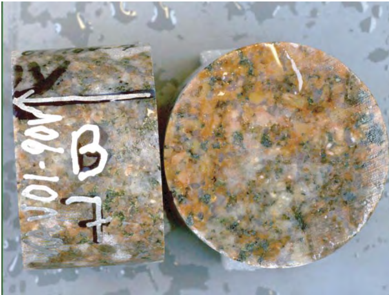
Figure 5-1. Specimens KAV-90V-07.