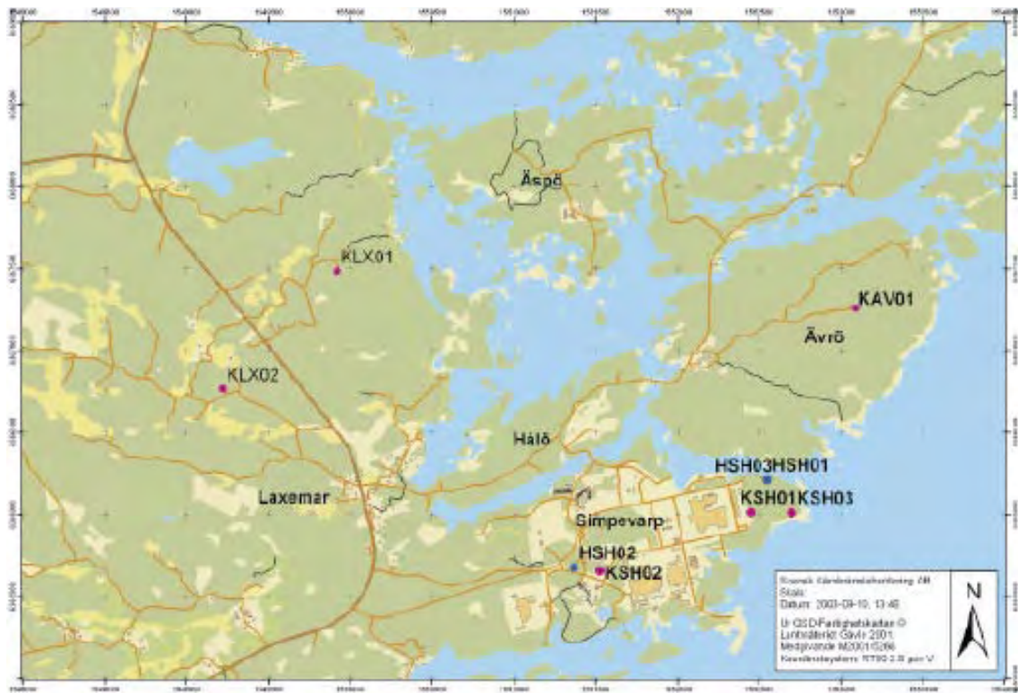
Figure 1-1. Map of Oskarshamn site.