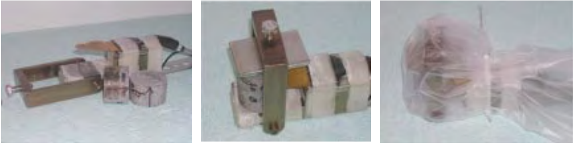
Figure 3-2. Specimens prior to mounting (left), mounted in stainless sample holder (middle), and sample holder with mounted specimens wrapped in plastic (right).