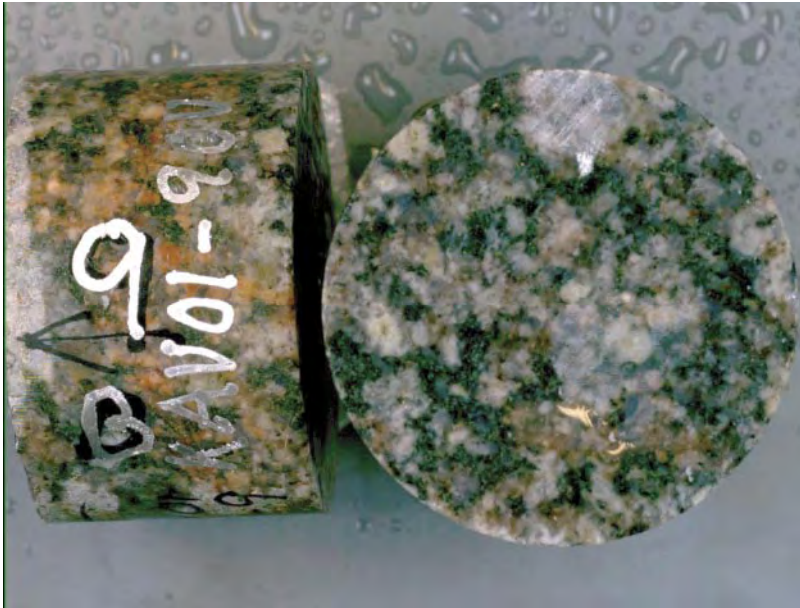
Figure 5-3. Specimens KAV-90V-09.