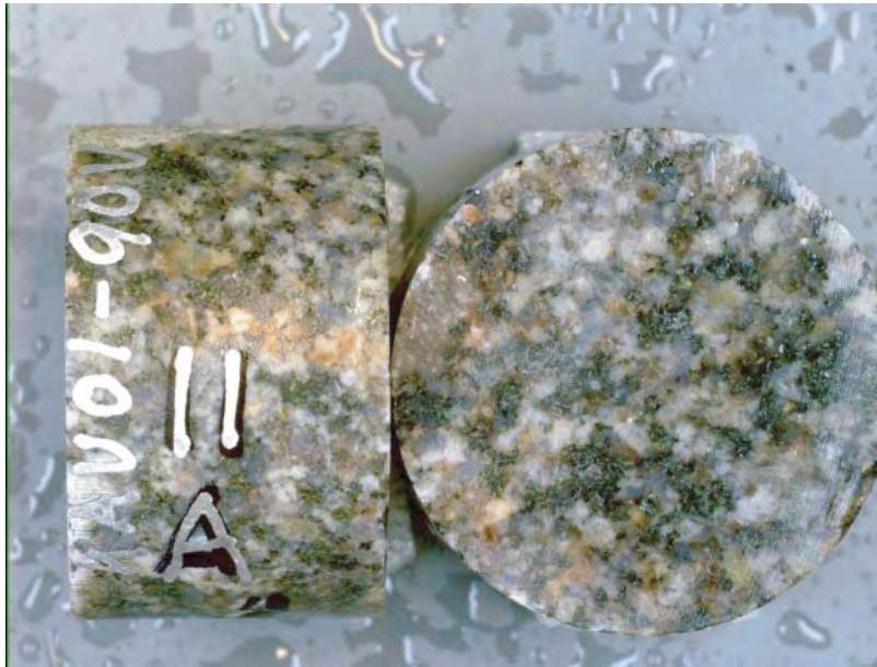
Figure 5-5. Specimens KAV-90V-11.