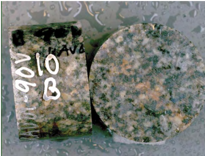
Figure 5-4. Specimens KAV-90V-10.