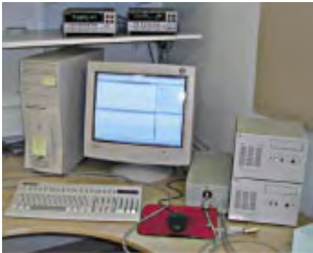
Figure 3-1. TPS-apparatus with source meter, multi-meter, bridge, and computer.