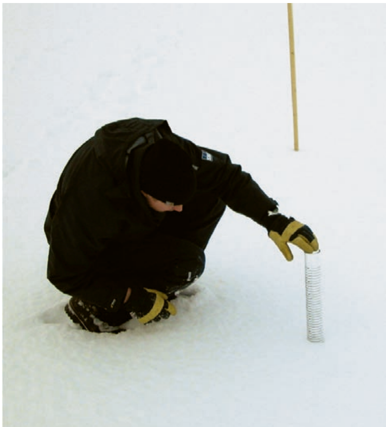
Figure 4-1. Measurement of snow depth with plastic tube at Storskäret, AFM000071.

The ice conditions were observed every morning during working-days for the sea and approximately once a week for the lake.