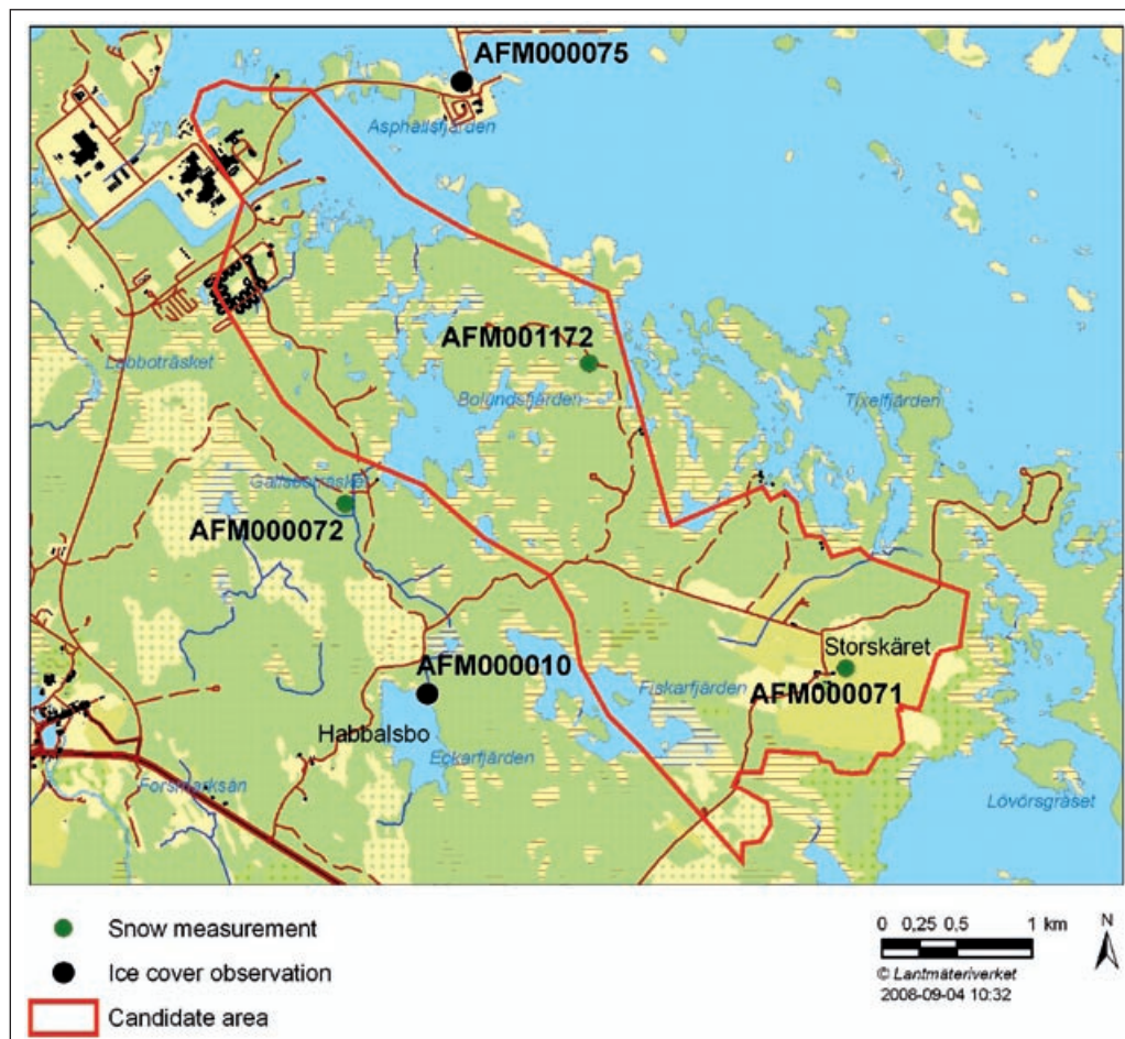
Figure 1-1. Locations of measurements and registration of meteorological winter parameters.

Original data from the reported activity are stored in the primary database Sicada. Data are traceable in Sicada by the Activity Plan number (SKB AP PF 400-08-007). Only data in databases are accepted for further interpretation and modelling. The data presented in this report are regarded as copies of the original data. Data in the databases may be revised, if needed. Such revisions will not necessarily result in a revision of the P-report, although the normal procedure is that major revisions entail a revision of the P-report. Minor revisions are normally presented as supplements, available at www.skb.se .