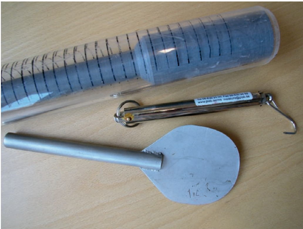
Figure 3-1. Equipment used to measure snow depth and snow weight.

The observations of ice freeze-up and ice break-up were performed by visual inspection.