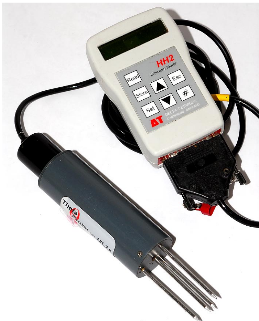
Figure 3-2. Moisture meter HH2 with ML2x probe used for ground respiration measurements.

To measure the soil moisture a moisture meter, HH2 with a ML2x probe, from Delta-T Devices was used, see Figure 3-2. At each measurement point for ground respiration measurements, the soil moisture was measured in three different points and the mean value was calculated and used. The moisture meter was set to organic soil.