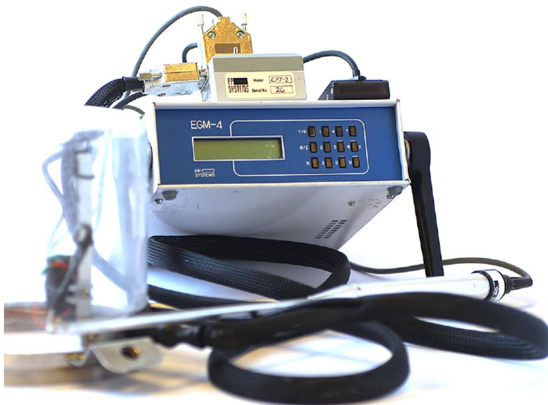
Figure 3-1. Infrared Environmental Gas Monitor, EGM-4, with assimilation chamber and ground temperature probe.

Data are stored in the EGM-4 and easily transferred to a computer. The Operator's manual for EGM-4, version 4.13, 2003, was used.