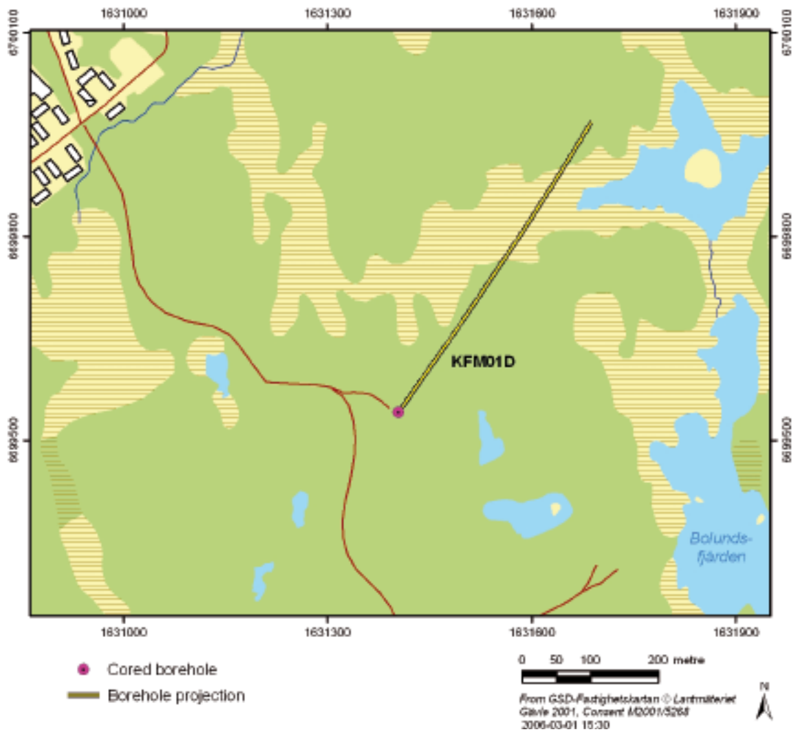
Figure 1-1. General overview over the Forsmark area showing the location of the borehole KFM01D.