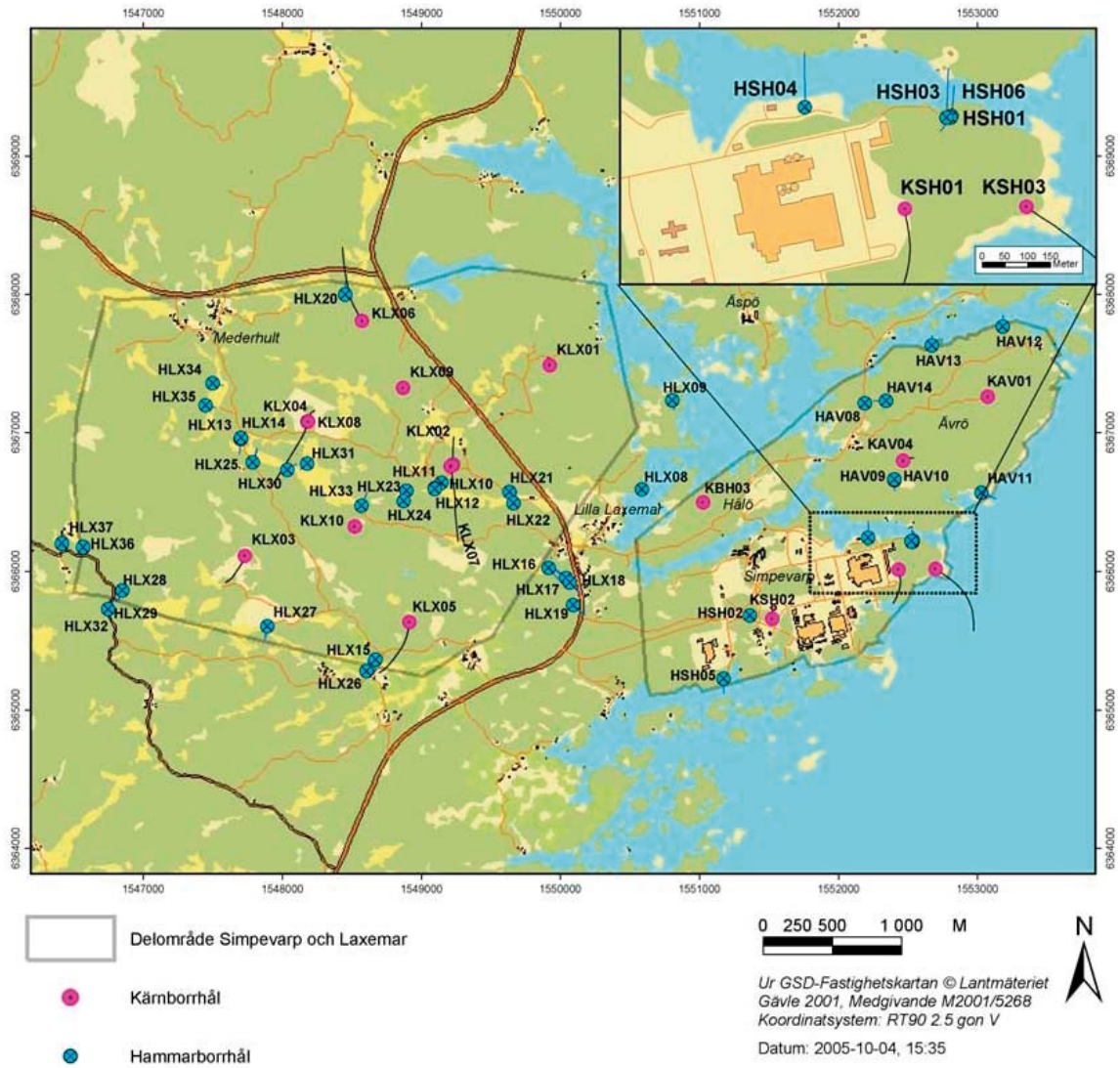
Figure 1-1. Location of the borehole KLX09.